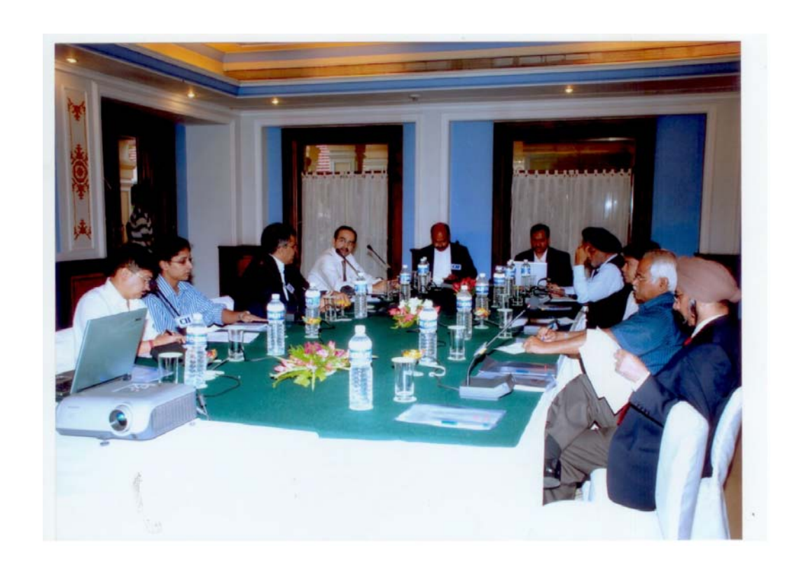
Annexure – Consolidated Vision Elements from Workshops & Interview