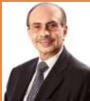
Mr Adi Godrej

Chairman India@75 Foundation & Chairman Godrej Group